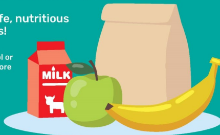
This institution is an equal opportunity provider.

Each year families must fill out a form to determine if they qualify for free or reduced priced meals. Since all meals are free this year, that form is no longer needed for meals. However, we still need this information for state and federal funding. This also helps us determine which families would qualify to have enrollment fees waived or reduced. You will see this with the online enrollment forms or your will receive a form in the mail.